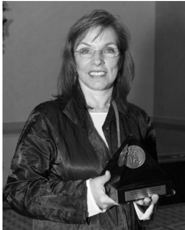
Distinguished Career Award Marsha Norman Pulitzer and Tony Award-winning Playwright